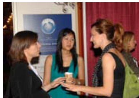
Camaraderie among members at the Global Congress.