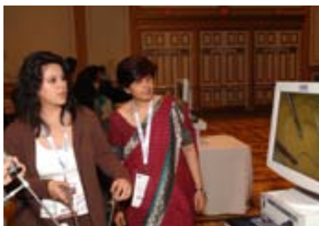
Hands-on learning in the suturing lab