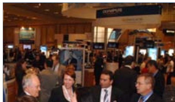
Innovation on display in the Exhibit Hall