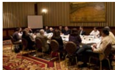
Governing – the Board of Trustees in session