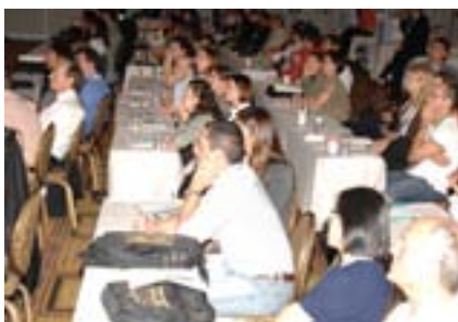
Learning at a Plenary Session