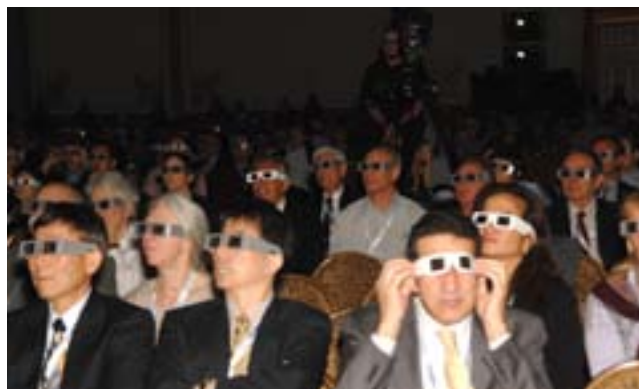
3D Movie and 4k technology during Keynote Presentation