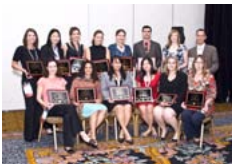
2008 Graduates of the AAGL/SRS Fellowship