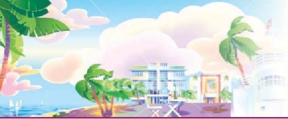
Exhibit Rules and Regulations

As a condition of participation in the AAGL exhibition, each exhibitor, its representatives, and agents must agree to and abide by all rules and regulations set forth in the exhibitor's prospectus, service manual, and other correspondence of AAGL, its contractors/agents, and the hotel.