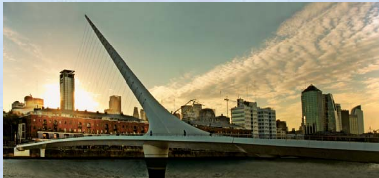
Buenos Aires, Argentina – 2012