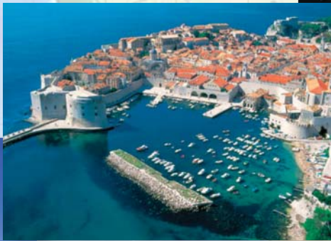
Dubrovnik, Croatia – 2010