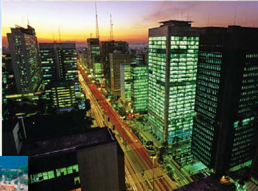
Sao Paulo, Brazil – 2008