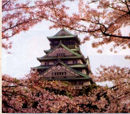
Osaka, Japan – 2011