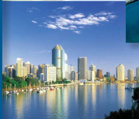
Brisbane, Australia – 2009