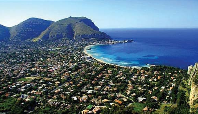
Palermo, Italy – 2007