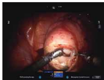
Image 4 (top): A spinal needle injects a dilute vasopressin solution into the fibroid pseudocapsule. Image 5: An initial incision is made to find the fibroid, using the PK Dissector (left) and HotShears (right).