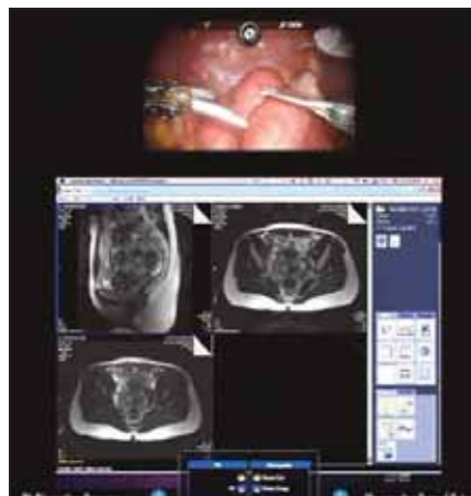
Image 1 (left): Below the endoscopic view of the fibroid uterus (top), MR images are superimposed in the surgeon's console viewer. The upper left MR image is a sagittal pelvic view indicating the presence of fibroids (left to right) in the posterior fundal, submucosal, and posterior midportion of the uterus. The upper right and lower left images are axial views showing fibroids (top to bottom) in the anterior left, submucosal left midportion, and posterior midportion of the uterus. In Image 2, the relative size of the images are adjusted to the surgeon's needs.

MR images can now be incorporated in a real-time, 3-dimensional fashion into the surgeon's console for use in mapping, de-