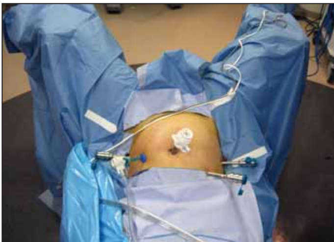
Image 3 shows robotic trocar placement in a 4-arm approach.

the presenting fibroid and the camera trocar site.